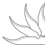
PACK OF 4