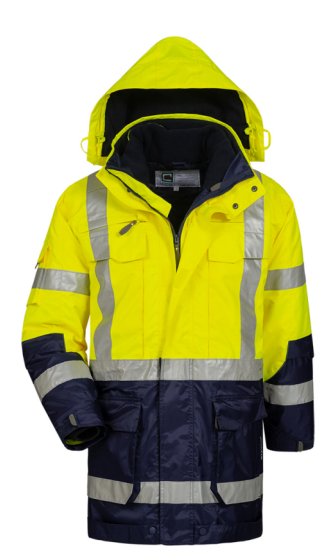
Catalogue Page: 198